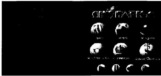
Figure 2: From left to right and top to bottom, background image, logo, dialogue situation icons and video control buttons.